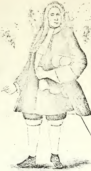
PETER SCHUYLER.—[FROM AN OLD PRINT.]